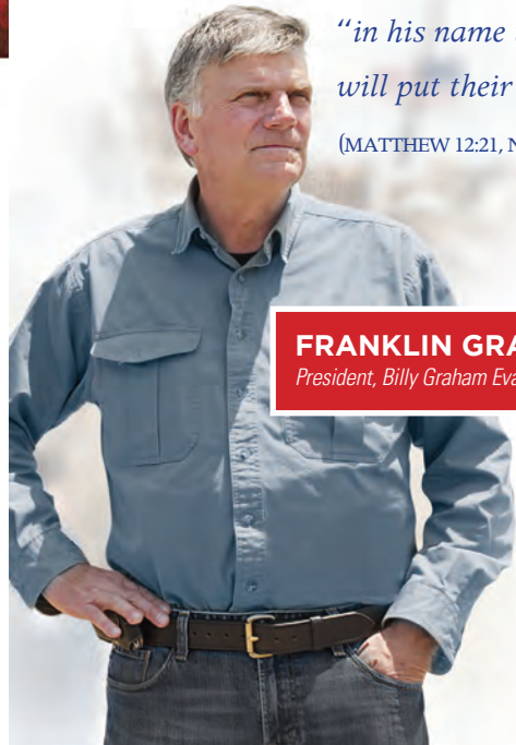
FRANKLIN GRAHAM President, Billy Graham Evangelistic Association

“in his name the nations will put their hope” (MATTHEW 12:21, NIV)?